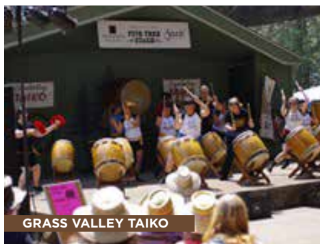
GRASS VALLEY TAIKO