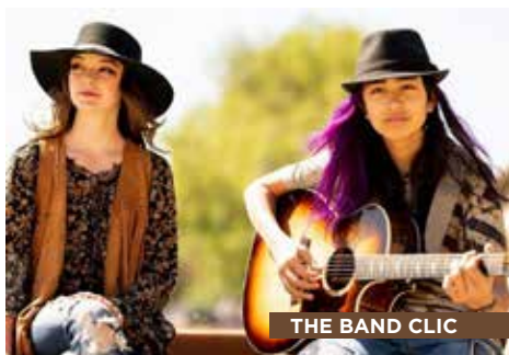
THE BAND CLIC

These five fine felines bring a unique and excitingly fresh take on classic, feel-good country — combining tasty chick'n pick'n licks and starry pedal steel cascades with Captain Kitten's playful wit and creamy baritone drawl — a sound they've dubbed "texafornia outlaw country."