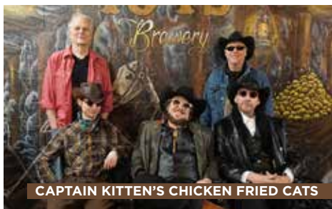
CAPTAIN KITTEN'S CHICKEN FRIED CATS

All string, all sing, all the songs of past and present Hawaii! You will find yourself in the islands at ease kicking back with family and friends. . .this is the music of Ho'okipa. Life's a beach. . .see you there!