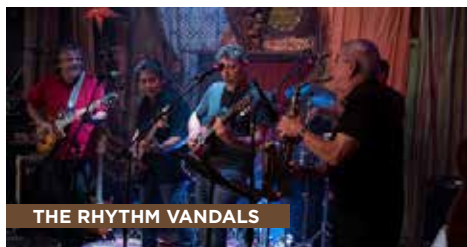
THE RHYTHM VANDALS

The Stones, Santana, Bad Company, and many more!