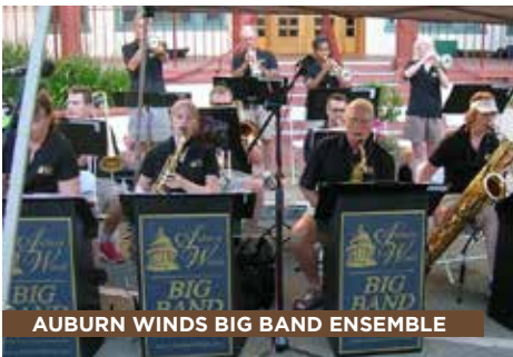
AUBURN WINDS BIG BAND ENSEMBLE

Together they connect audiences to great music ranging from genres of blues, rock, soul, and country. Depending on venue they perform as a duo or with a full band.