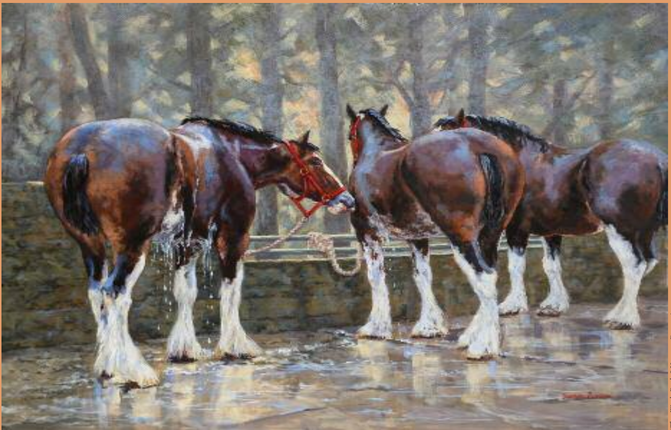
"The Wash Rack," Yvonne Bonatci